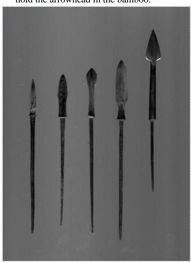
Photo of the antique yajiri used in the construction of arrows. From left to right Sankaku, Yanagi-ba, Tsubeki-ne, Yanagi-ba, and a Hira-ne.

6. Antique Japanese arrowheads are used on five of the arrows and reproduction arrowheads were used on three; each antique yajiri arrowhead is approximately 300 years old. All the arrowheads represent what was available in the mid 1500s. Prior to fitting of the arrowhead, each bamboo shaft was drilled by hand. The arrowhead tangs were heated and forced into the bamboo shaft. No glue or adhesive is used to hold the arrowhead in the bamboo.